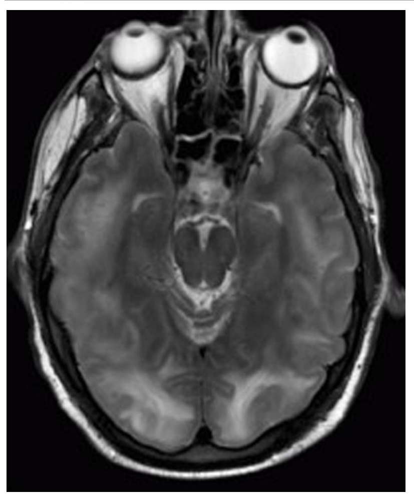
CT (A and C) and FLAIR MRI (B and D): subtle CT hypoattenuation is noted within the bilateral parietal (A) and occipital and posterior temporal (C) gray matter and subcortical white matter, corresponding to abnormal T2 hyperintensity seen on MRI (B and D). No diffusion abnormality or evidence of hemorrhage is present: